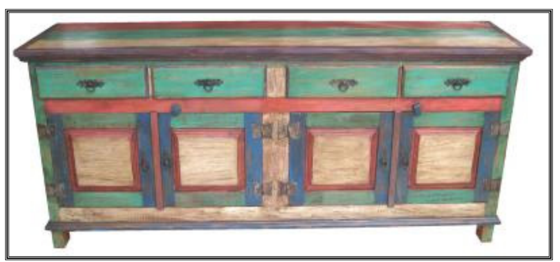
Light Line: GG-0053

Contact us for an information packet with check list and suggestions to create your one-of-a-kind heirloom.