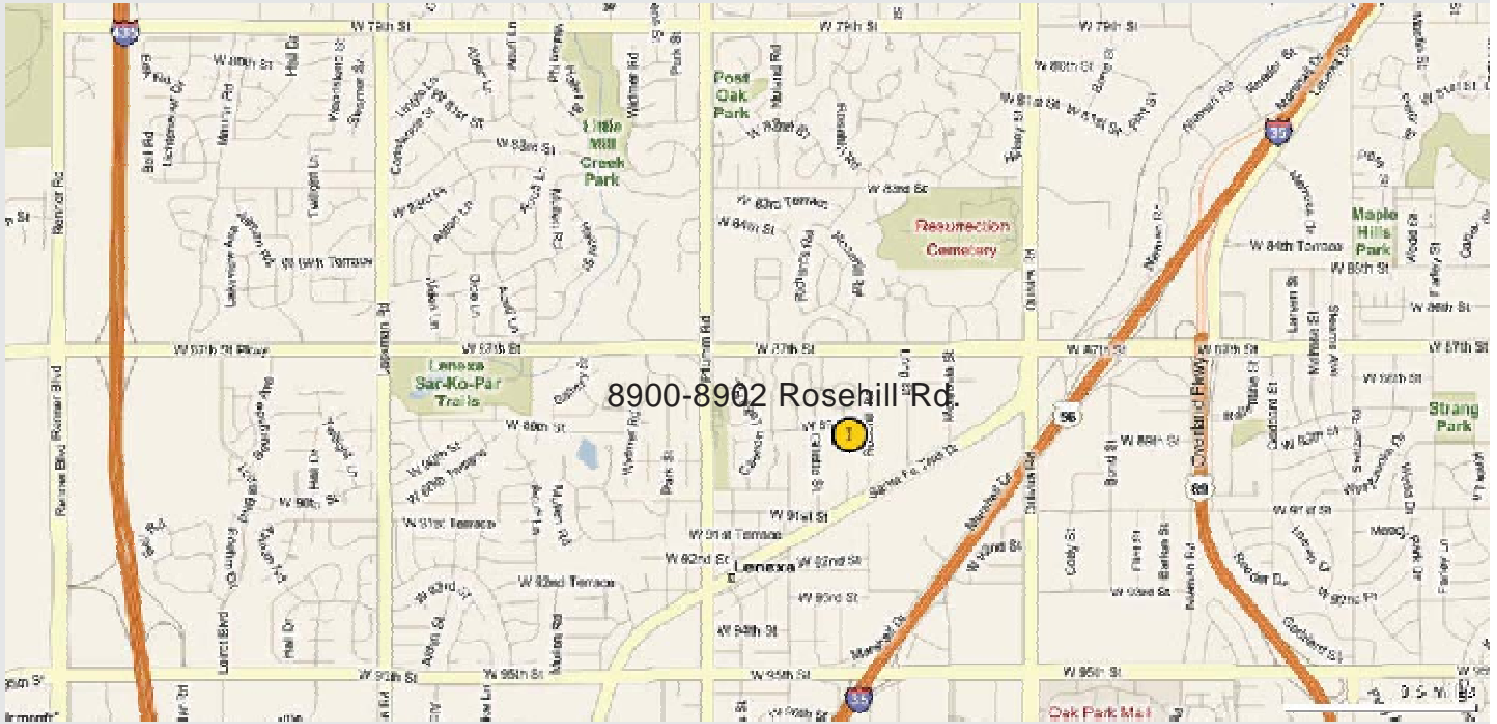
Property Locator Map